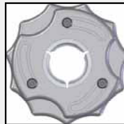
Above Left - Open Tri-Nut Above middle: Tri-Nut Closed Right - Complete Tri-Nut